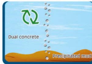
The Bottom of Pond